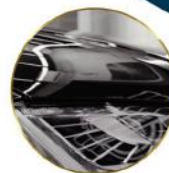
High Gloss Retention