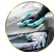
Used by Car Enthusiasts & Hobbyists